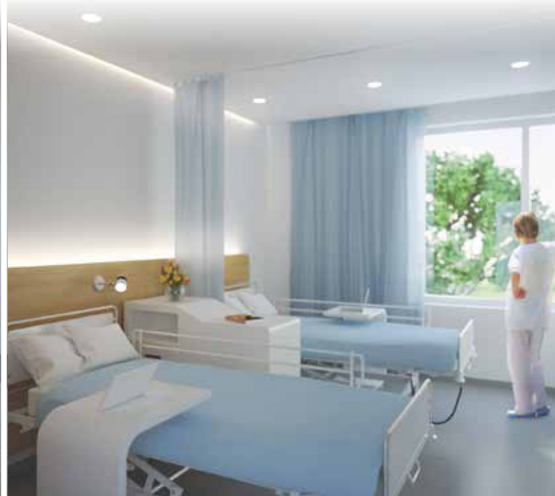
Philips visualized various hospital areas as part of its conceptual design.